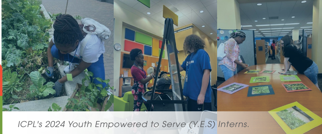
ICPL's 2024 Youth Empowered to Serve (Y.E.S.) Interns.