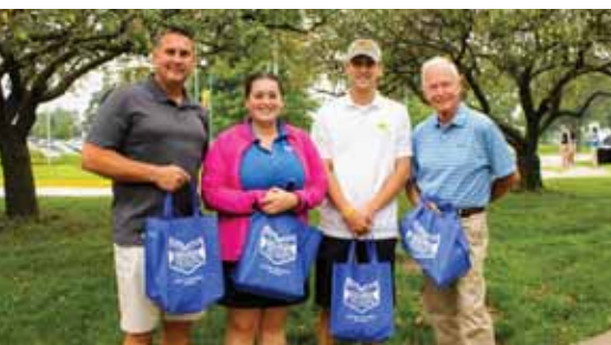
It was great weather for the Third Annual Library Links Golf Classic at Finkbine Golf Course in Iowa City. Thank you to all of the golfers who came out to support the Library.