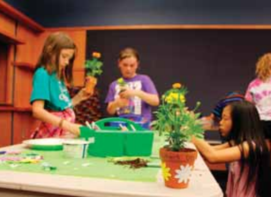
Young patrons decorate flower pots as part of the Library's Totally Tweens program. Totally Tweens features events and activities for third through sixth grade students.