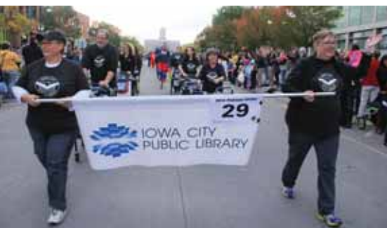
(above) The Library's Book Cart Drill Team made its annual appearance at the 2014 University of Iowa Homecoming Parade. (below) The ICPL Friends Foundation hosted its first ever Family Fun(d) Night in February, opening the Library to families after hours.