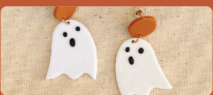
CLAY HALLOWEEN EARRINGS